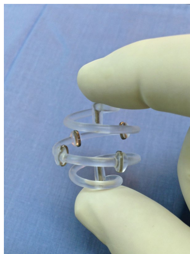
3D BioZorb device with titanium clips.

Ideally, of course, the radiation oncology team wants to treat no more tissue than is necessary, to minimize the overall dose for the patient, and to avoid, if possible, irradiating adjacent healthy tissues and structures, such as the heart, skin, and lungs. At our