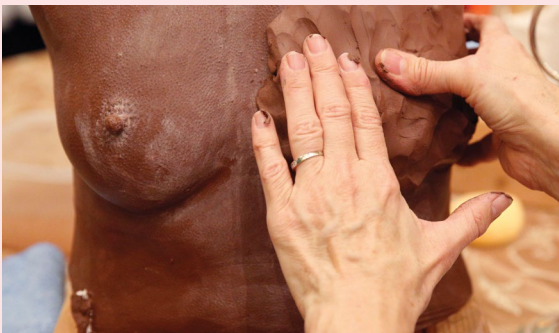
At the School of Oncoplastic Surgery's sculpture lab, surgeon participants learn about the aesthetics of the breast while working with real-life clay models.

Courses are also available internationally, especially in Europe, where oncoplastic surgery is practiced more widely than in the U.S. and where development of oncoplastic surgery began. For example, the Royal College of Surgeons of England ( rcseng.ac.uk ) presents a course titled "Specialty Skills in Breast Surgery: Principles in Breast (Level 2)" that teaches oncoplastic and other reconstructive skills. The course includes a cadaver component. The Breast Surgeons of Australia and New Zealand organization ( rcseng.ac.uk ) offers level 1 and 2 courses in oncoplastic surgery, with the level 2 course including a cadaver workshop.